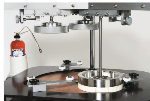
Full line of Hyprez Slurries, Accessories, Plates and Dispensing Systems are available