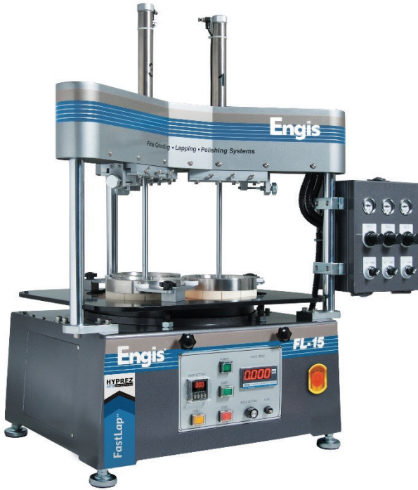
Model FL-15VP (Pneumatic) shown above Model FL-15V (Hand Weight) shown below