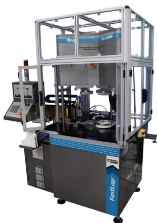
Model FL-15VPF (with Plate Facing and Main Bearing Grease Pump)