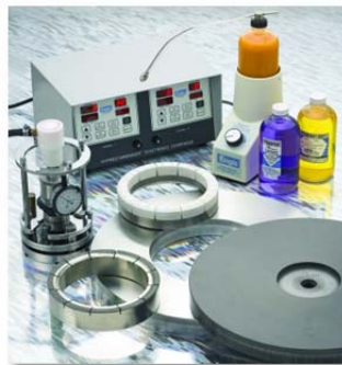
Full line of Hyprez ® Slurries, Accessories, Lap Plates and Dispensing Systems are available