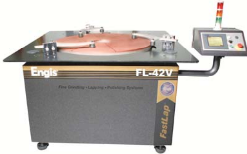
Model FL-42V Non-Pneumatic (Hand Weight)

Versatility and speed are the hallmarks for the newest line of Engis lapping and polishing machines.