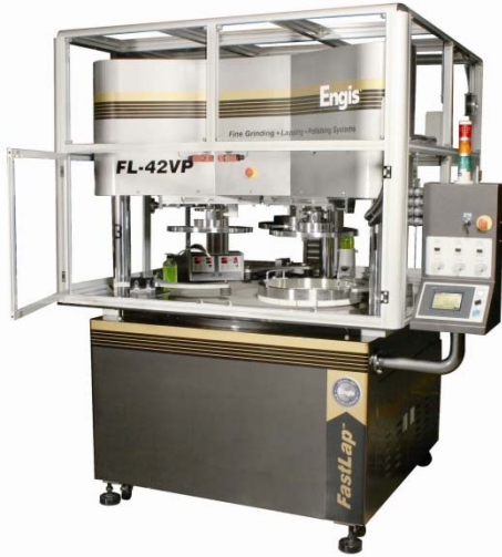
Model FL-42VP (Pneumatic) shown above with optional Dust Cover